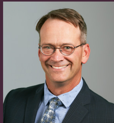
HENRY VAN DE VELDE Director