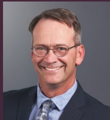
HENRY VAN DE VELDE Director