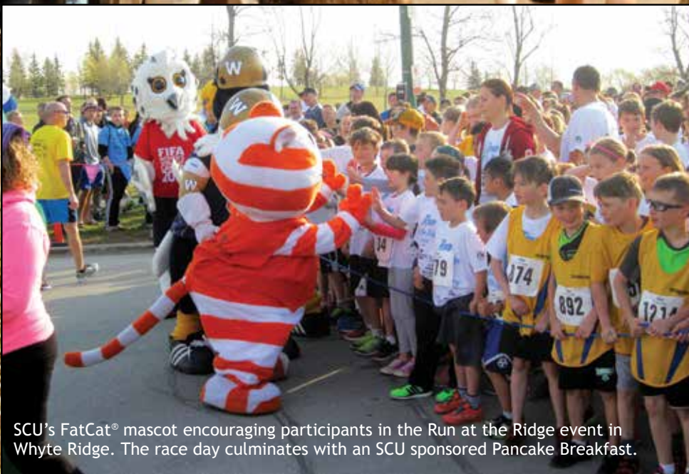
SCU's FatCat® mascot encouraging participants in the Run at the Ridge event in Whyte Ridge. The race day culminates with an SCU sponsored Pancake Breakfast.

A tree grows stronger through time and SCU has also weathered the years and grown into a mature dependable financial institution. As we build our credit union we also build our communities. SCU supports many special events and projects that are imperative to a growing community. Helping those around us also comes naturally for the staff at SCU. In 2015 the staff generously donated time and energy raising funds, hosting events and volunteering for local charities. Because of a strong and caring membership and staff, SCU will sustain a level of growth that future generations can depend on.