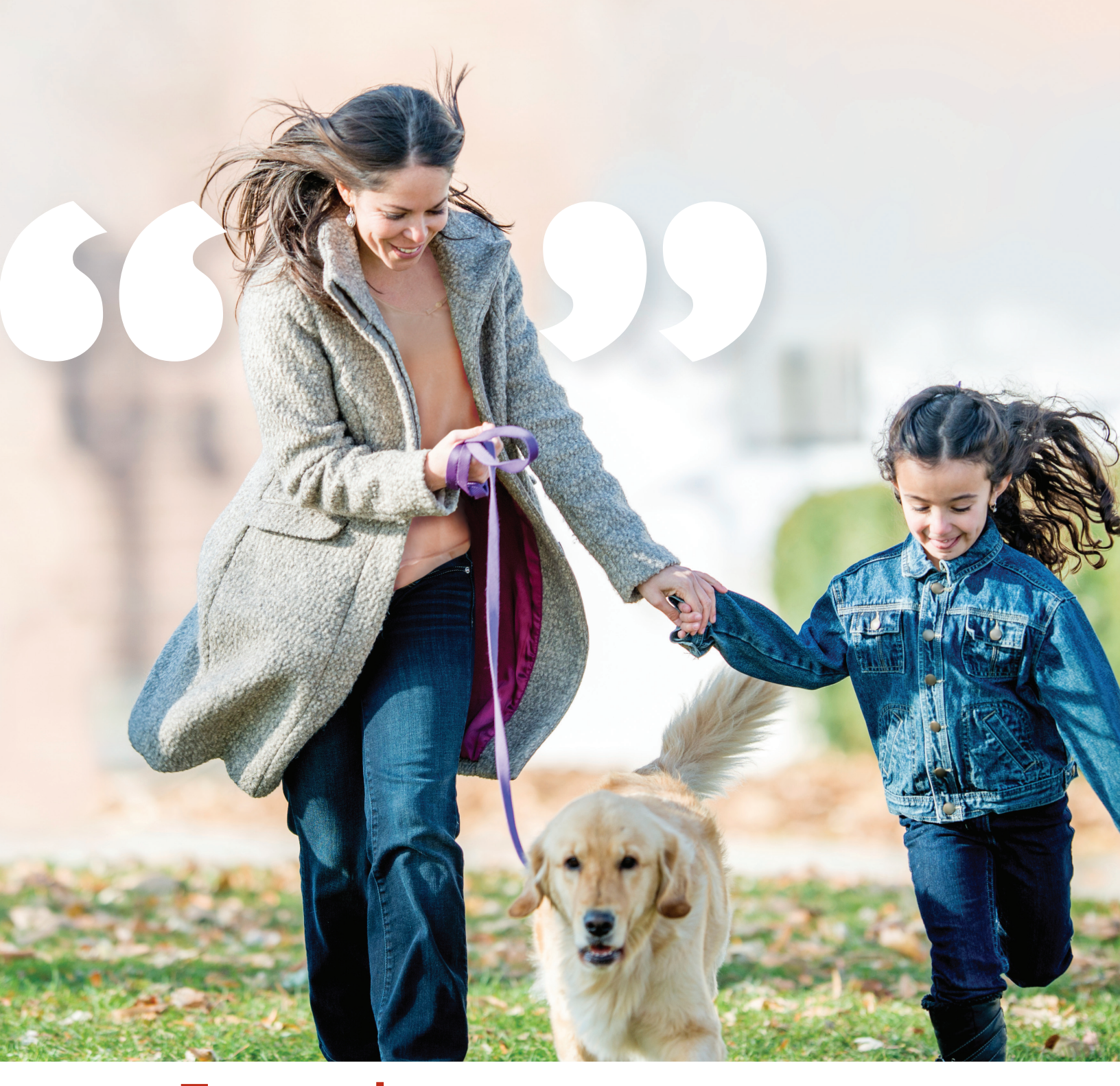
Focused on you.